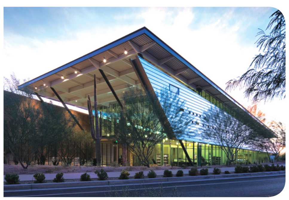
DURANAR® VARI-Cool® coatings by PPG Industrial Coatings shift from dark green to silver to mauve, depending on light conditions and viewing angle.

Beyond its color and reflectance, Jones said the design of the metal siding is integral to minimizing the building's overall energy consumption. "Besides reflecting away a lot of